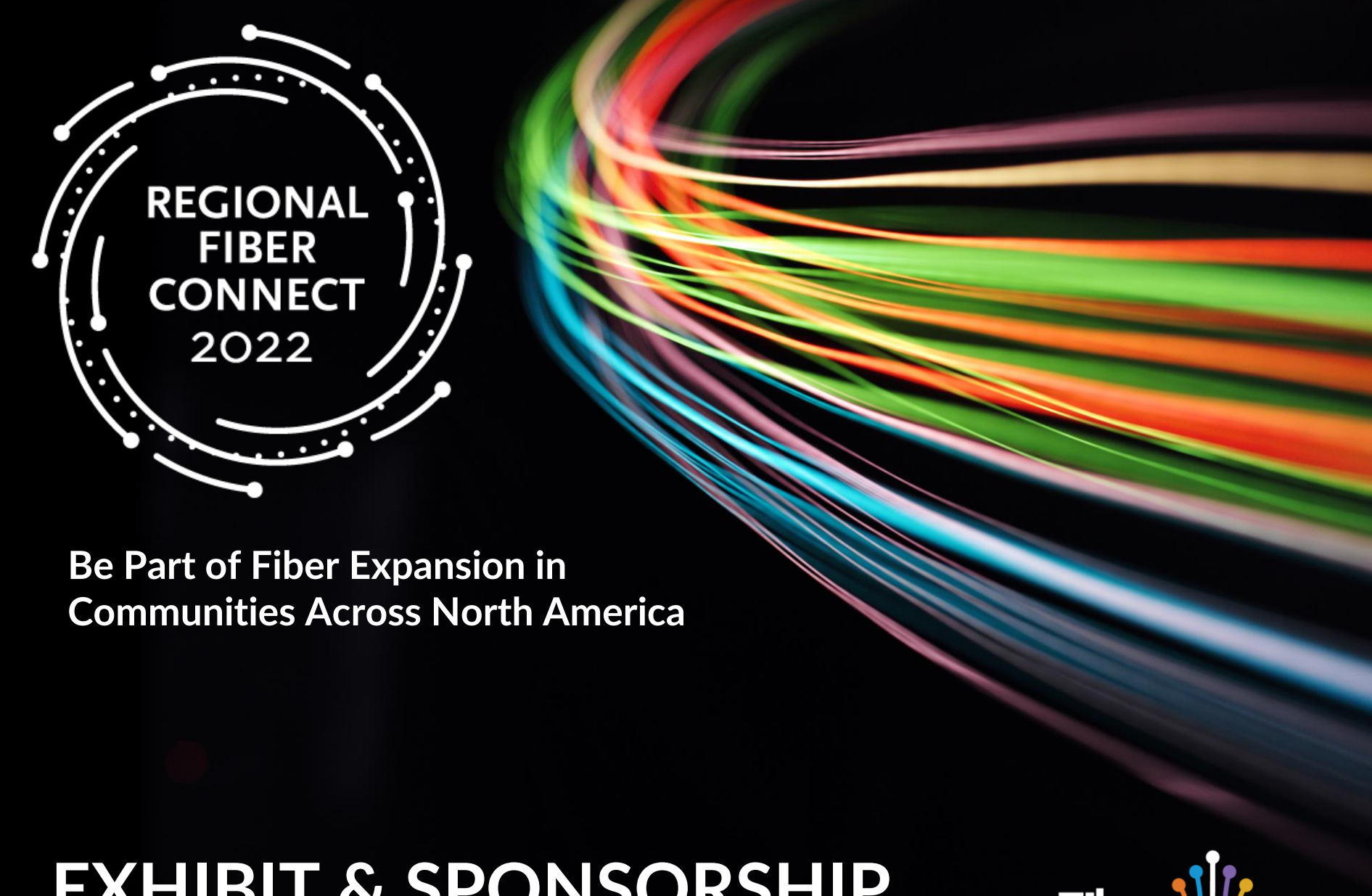
EXHIBIT & SPONSORSHIP INFORMATION