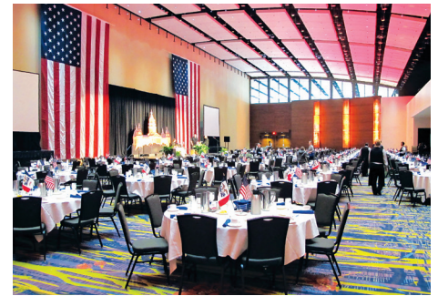
Banquet in Grand Ballroom A