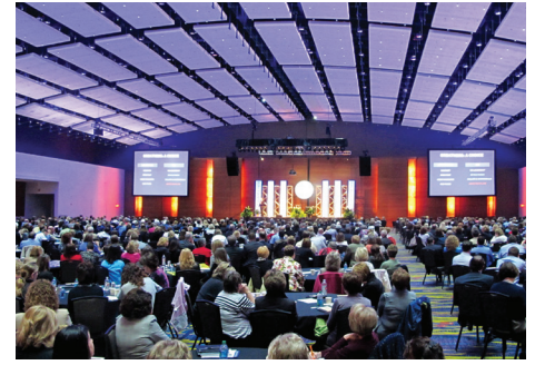
General Session in Grand Ballroom