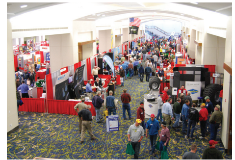
Tradeshow on Grand Concourse