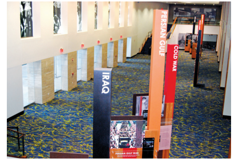
Veterans Memorial Hall