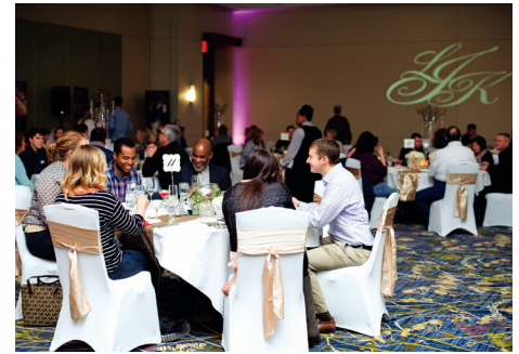
Wedding Reception on Meeting Room Level