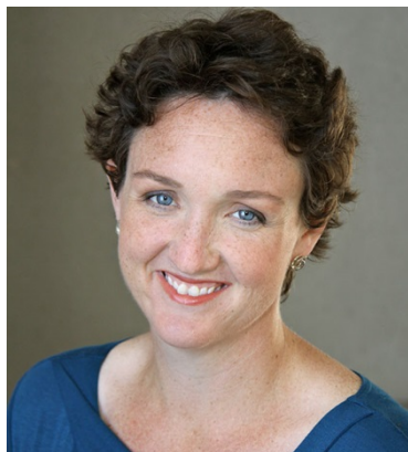
Katherine Porter Professor of Law University of California, Irvine School of Law