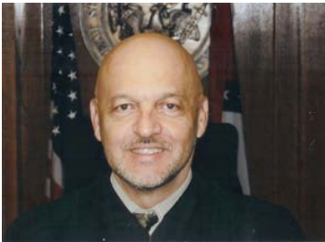
Hon. Wiley Branton, Jr. Circuit Judge Sixth Judicial District - State of Arkansas

seven years before being elevated to the United States Court of Appeals for the Eighth Circuit on May 26, 1992. He also served as a judge and presiding judge of the Foreign Intelligence Surveillance Act Court of Review from 2008 to 2013.