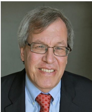
Erwin Chemerinsky Dean of the School of Law Distinguished Professor of Law Raymond Pryke Professor of First Amendment Law University of California, Irvine School of Law