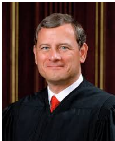
Chief Justice John G. Roberts, Jr. Chief Justice of the United States