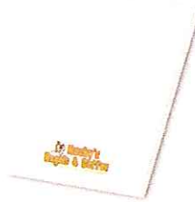
Note Pads w/Company Name and Logo