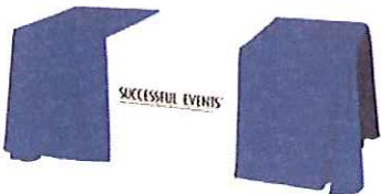
Table Runner w/Company Name and Logo (displayed during selected food & beverage events)