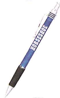
Clipper Ink Pens w/Company Name and Logo